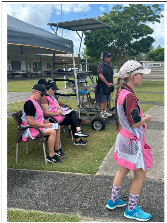
Some trap participants. Scoring Ladies modelling new pink jackets. Available for borrowing while shooting. Looking sharp too.